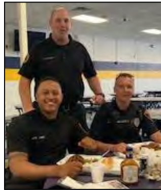
Friends of the Gloucester Club.