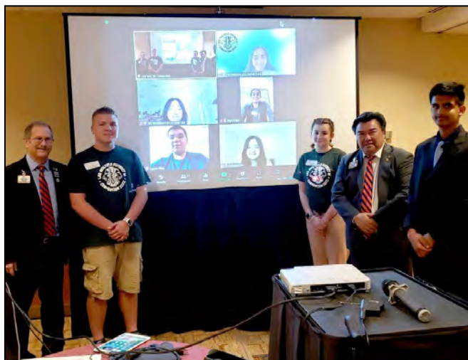
In-person and virtual attendees are sworn in as the Leo MD 16 2022-2023 Officers and Directors.