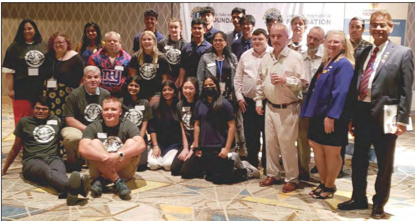
Leos and Club Advisors pose together after their “Round Table Luncheon.”